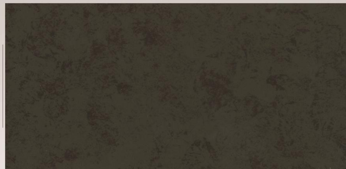
Powder Coating: 9B-058-A004 + Heat Transfer Film: 6052/01