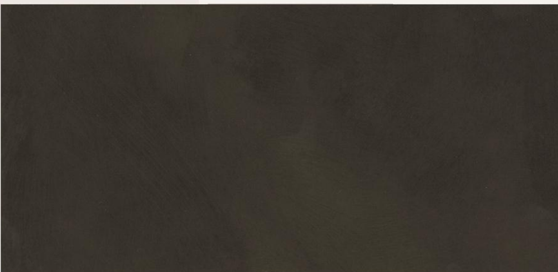
Powder Coating: 9B-058-A004 + Heat Transfer Film: 5007/01