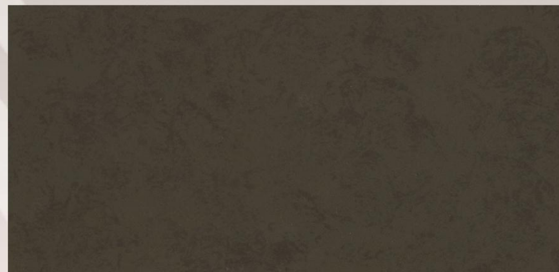
Powder Coating: 9C-058-A004 + Heat Transfer Film: 6052/01