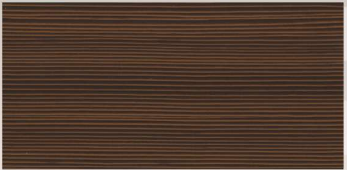
Powder Coating: DS 442 + Heat Transfer Film: 2121/02