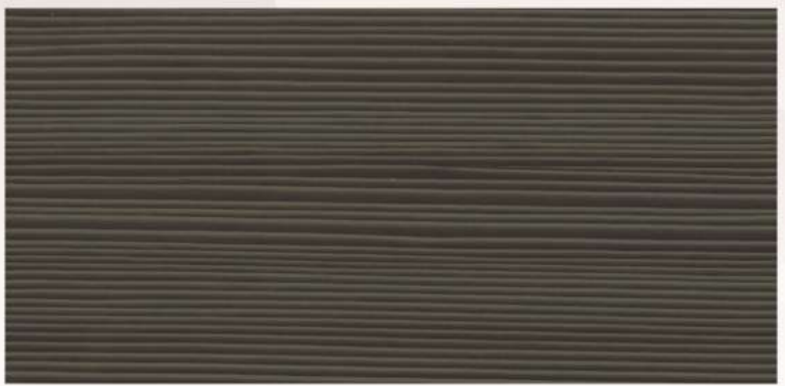
Powder Coating: 8C-049-A001 + Heat Transfer Film: 2121/02