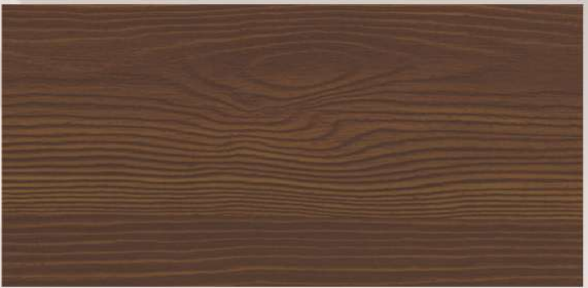
Powder Coating: DS 721 + Heat Transfer Film: 2117/02