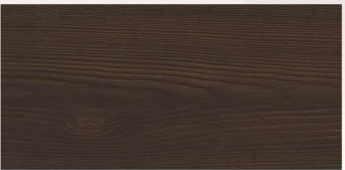
Powder Coating: DS 472 + Heat Transfer Film: 2117/03