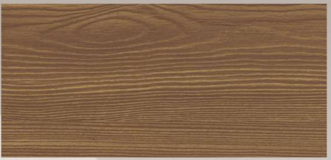
Powder Coating: DS-0418S + Heat Transfer Film: 2117/01