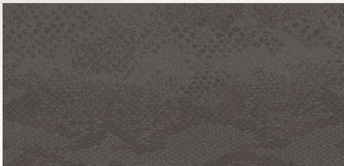
Powder Coating: Colibri-018 + Heat Transfer Film: 6058/01