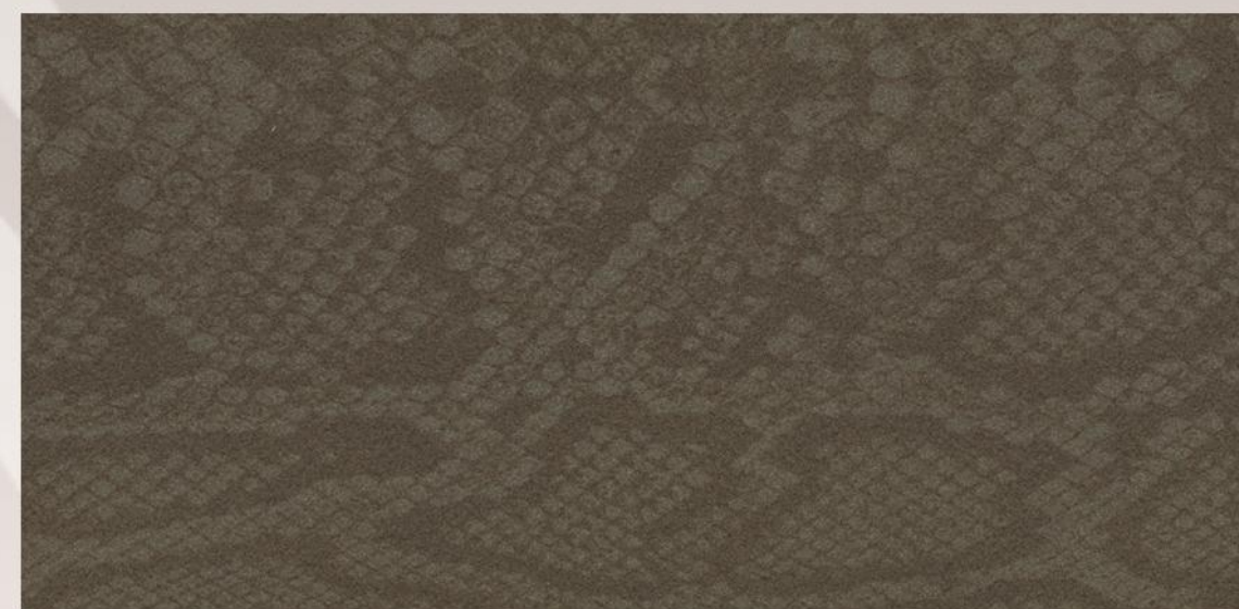
Powder Coating: Colibri-017 + Heat Transfer Film: 6060/01