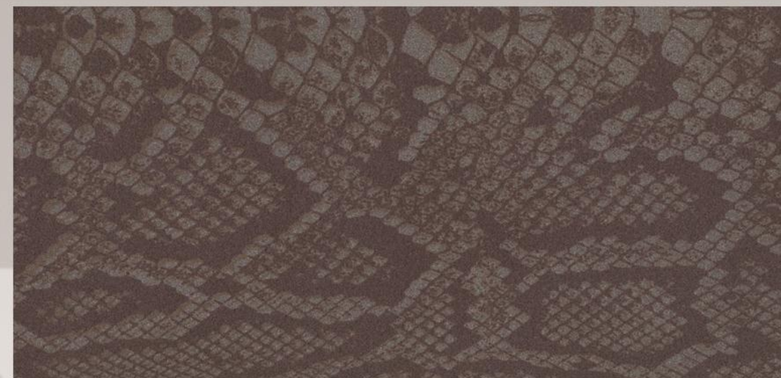
Powder Coating: Colibri-016 + Heat Transfer Film: 6060/01