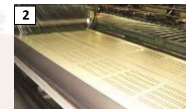
Metal sheet decoration with industrial implant