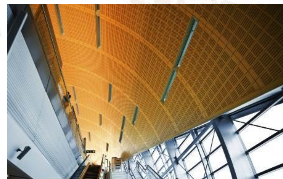
Ceiling of the Dubai underground station

The special mechanical features of the 3C-XXX-A015 (PS-06XXP3) series are most valued in the manufacturing of ceilings, doors, furnishings, and all those workings where post-decoration bending can result in a facilitation of the production process.