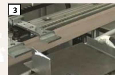
Bending of metal sheets after decoration