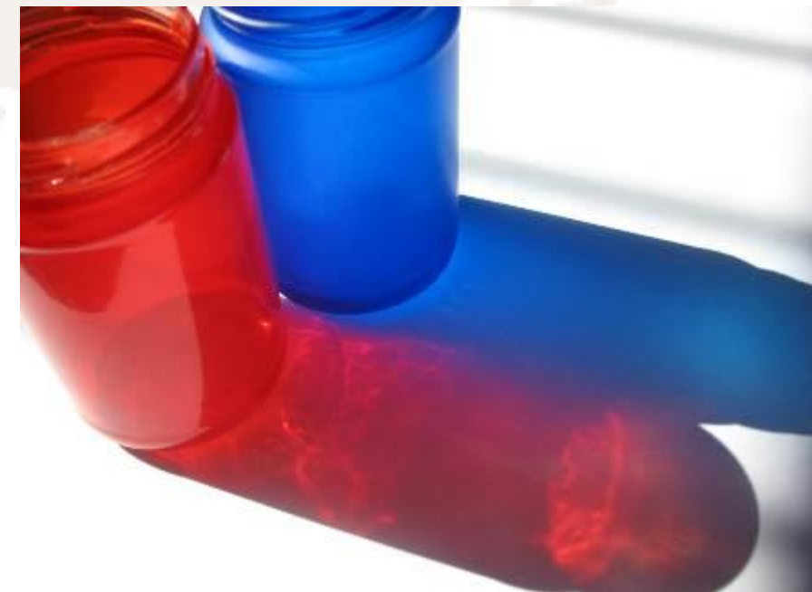
Picture 2: Jugs decorated with Glass-001 (left) and Glass-003 (right).

The Glass powders are fully valued when the surface underneath can be glimpsed, so that new and unusual effects are created; but also when double coating highlights the color.