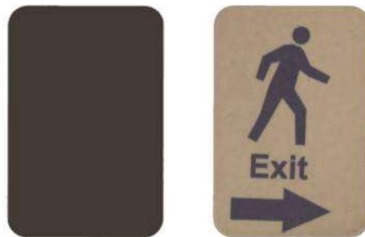
On the left, Thermo-008 (black), top coat on PE411 (white); On the right, after heating, the thermochromics powder coating becomes transparent and it is visible the heat-transferred image.

Heat-transfer technology on Thermo powders allows amazing effects: by matching the colour of the powder coat and the inks of the heat-transfer film, it is possible to make a picture (as well as a writing or a decor) appear and disappear by changing temperature: indeed, when the special pigments of the thermochromics powders change from coloured to transparent, the underlying picture becomes fully visible.