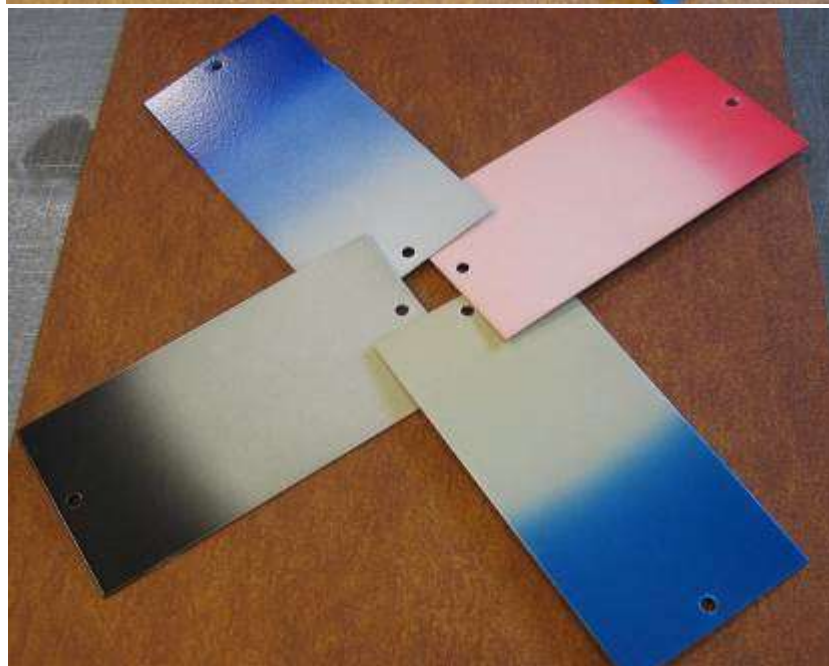
Double coated aluminium panels: different colours of thermochromics powders over a layer of white polyester; heating in the centre causes the Thermo powders to switch from coloured to transparent.